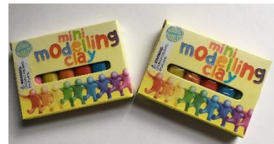
Mini modelling clay, cost £1 each.