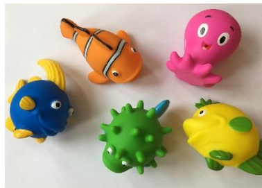
Squirty bath toys, ideal for baby/toddler party bags, cost £2.50 each.