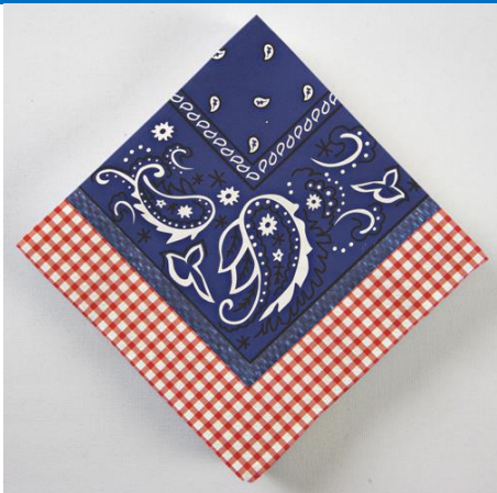
Napkins - Folded size 5"

*Note Napkins will be provided in complete packs of 20, these will not be split to match number of party guests