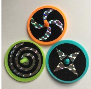
Sparkly spinners, cost £0.50 each.