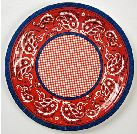
Plates – plate size 9"

Prices of boxes will vary based on number of party guests. For example, a standard Cowboy party box for 10 guests containing the items on this page will cost £36 excluding postage.