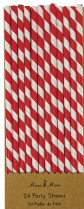
Red and White striped straws