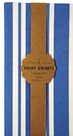
Blue and white striped paper tablecloth

*Note Napkins will be provided in complete packs of 20, these will not be split to match number of party guests