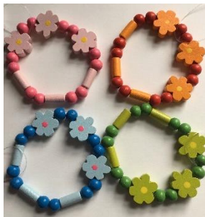
Wooden flower bracelets, cost £1 each.