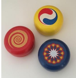
Wooden yo-yos, cost £2 each.