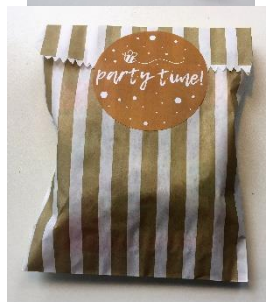
Bag of sweets cost £0.75 each, all sealed in a stripy paper bag.