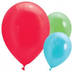
Balloons, cost £0.15 each.