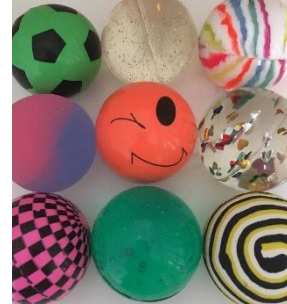
Bouncy balls, cost £1 each.